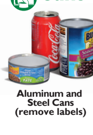
Aluminum and Steel Cans (remove labels)