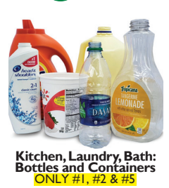
Kitchen, Laundry, Bath: Bottles and Containers ONLY #1, #2 & #5