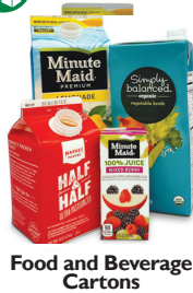
Food and Beverage Cartons