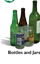
Bottles and Jars