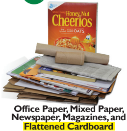
Office Paper, Mixed Paper, Newspaper, Magazines, and Flattened Cardboard