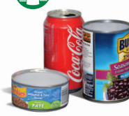
Aluminum and Steel Cans (remove labels)