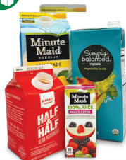
Food and Beverage Cartons