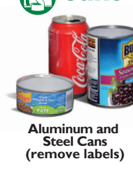
Aluminum and Steel Cans (remove labels)