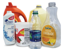
Kitchen, Laundry, Bath: Bottles and Containers ONLY #1, #2 & #5