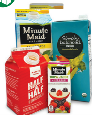
Food and Beverage Cartons