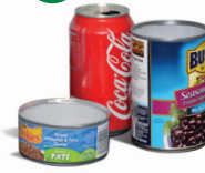
Aluminum and Steel Cans (remove labels)