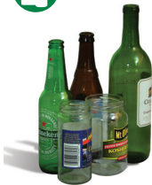
Bottles and Jars